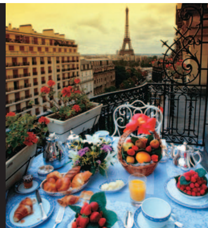
photography Grant Nowell