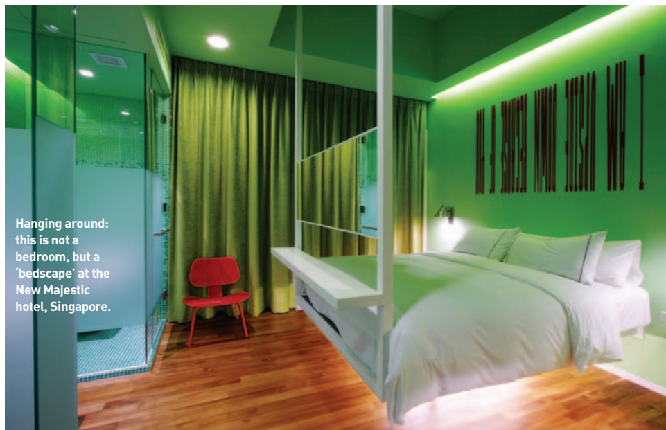
Hanging around: this is not a bedroom, but a 'bedscape' at the New Majestic hotel, Singapore.