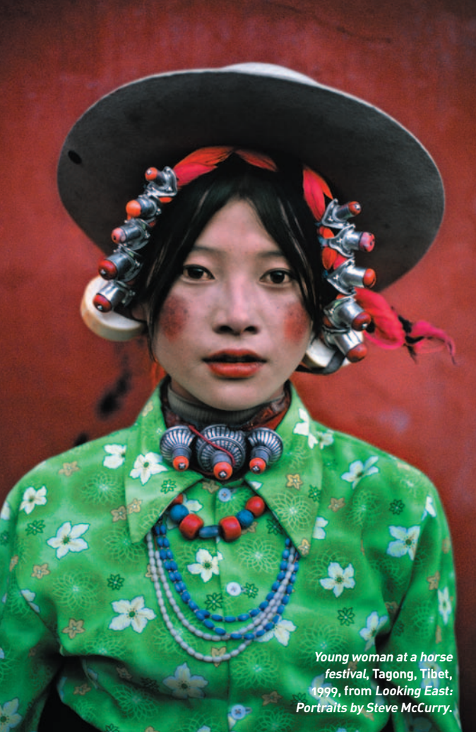
Young woman at a horse festival, Tagong, Tibet, 1999, from Looking East: Portraits by Steve McCurry.