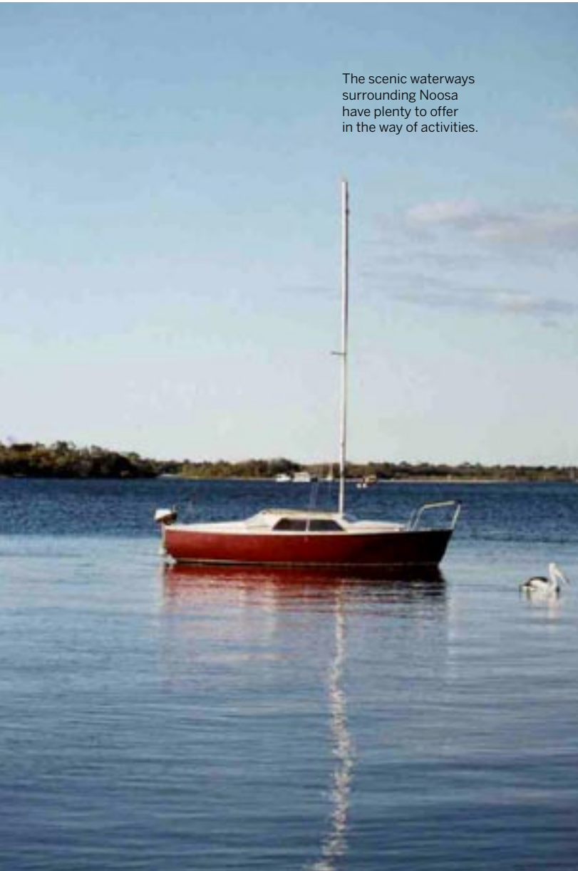
The scenic waterways surrounding Noosa have plenty to offer in the way of activities.

< dumplings or organic lamb burgers, and there's a crush at the Gympie Goat Cheese stand to try the cheesemakers' sensational, lemony day-old goat's curd.